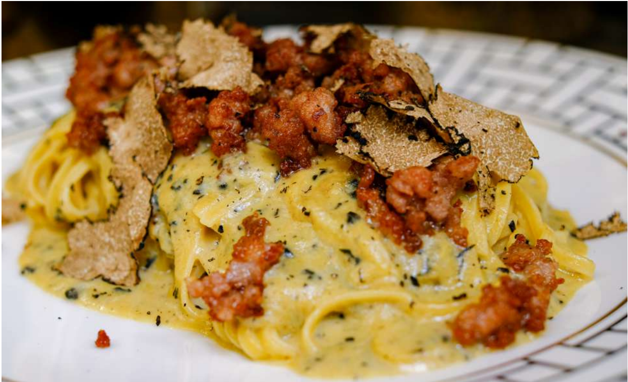
Angel hair in black truffle carbonara, crispy sausage, fresh truffle