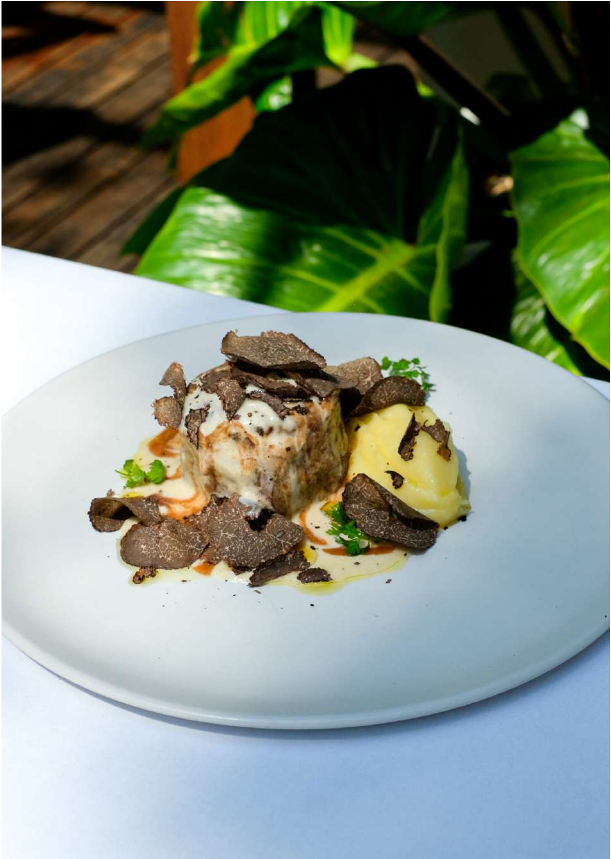
Australian beef tenderloin, foie gras sauce, fresh black truffle, mash potatoes