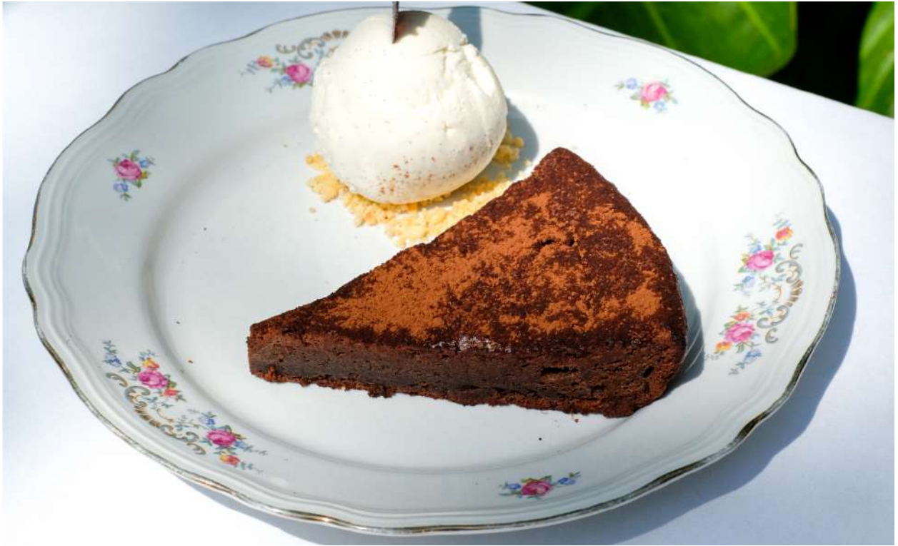
Soft chocolate cake with vanilla ice cream