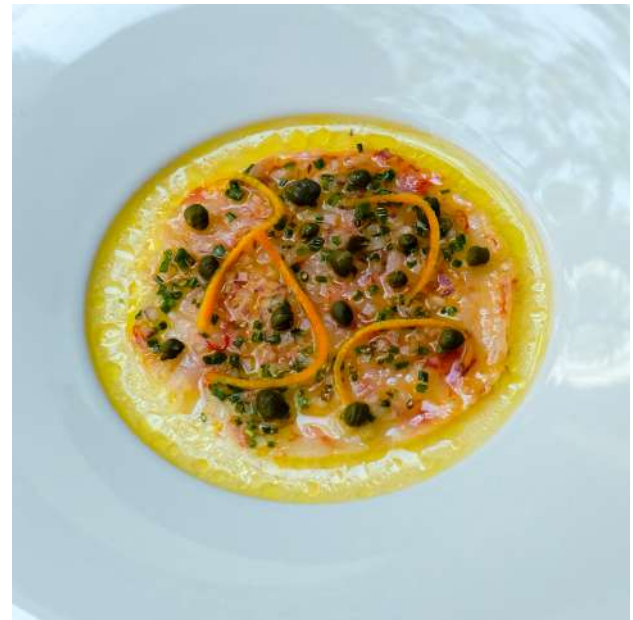
Red prawn carpaccio, orange, capers, basil