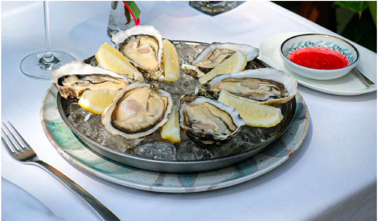
Oyster Gillardeau n°2, half dozen/ dozen