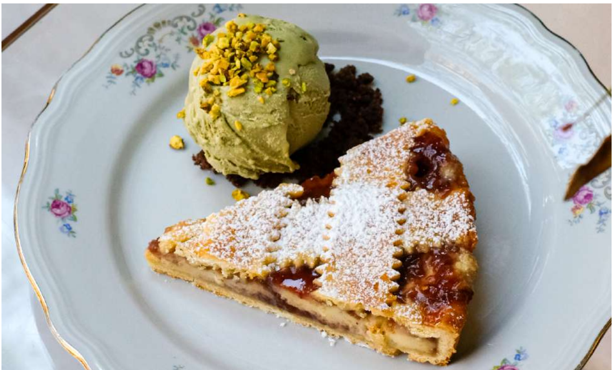
Raspberry tart, vanilla pastry cream, pistachio ice cream