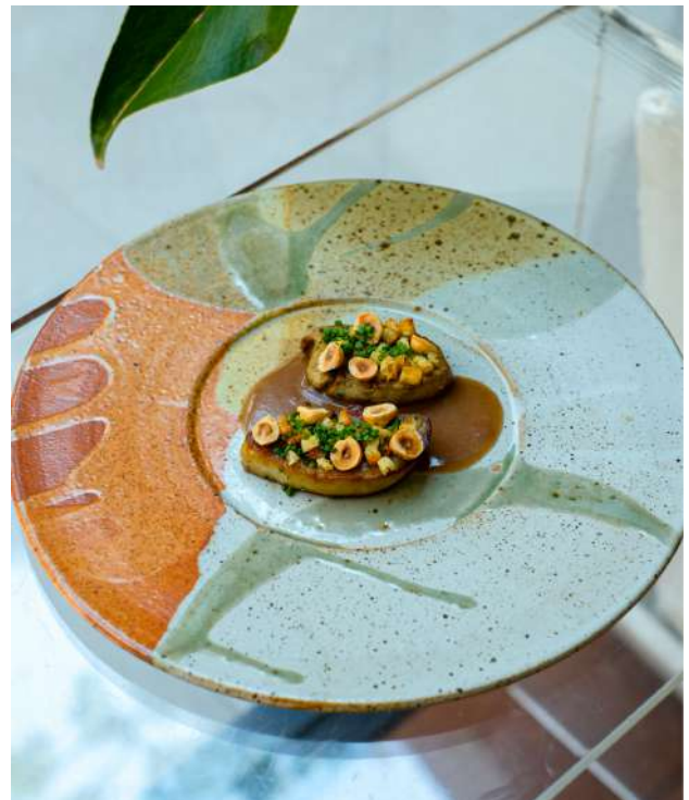
Roasted foie gras with brioche crumble, hazelnuts, candied cherries