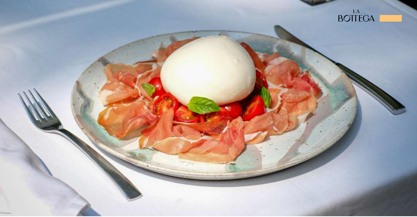
Italian burrata 250g with Parma ham 24months and fresh cherry tomato