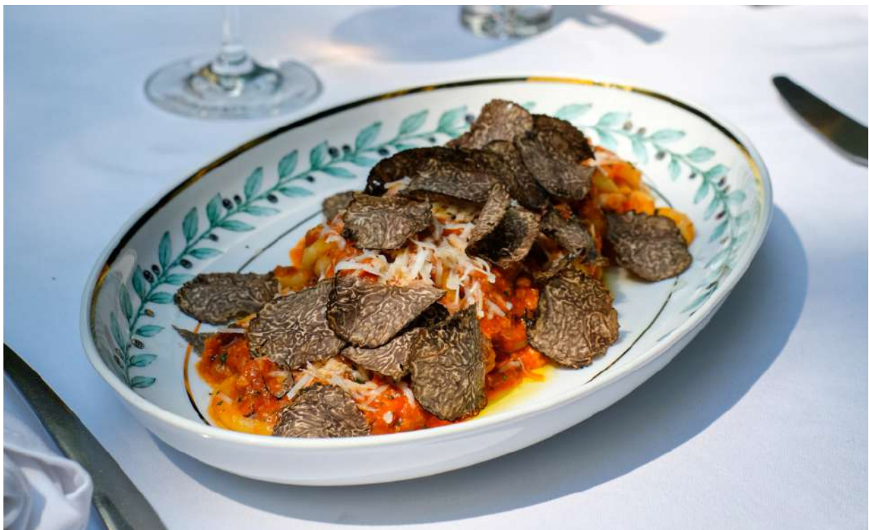
Pici with slow cooked duck ragout, fresh black truffle, Parmigiano Reggiano