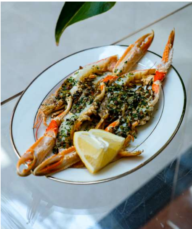
Pan fried Langoustine, olives, garlic, lemon, extra virgin olive oil